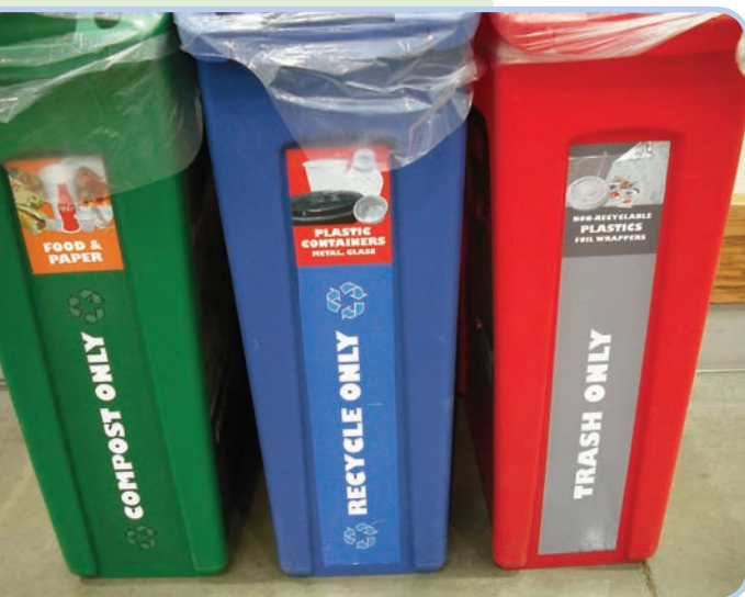
Costco's 3 bin system