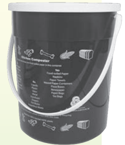
7 1/2" tall

Place all food scraps from the preparation of meals and plate scrapings from unfinished meals in an interior compost container. In Gilroy, we have a small black bucket and lid as an option. (see photo) If you would like one of these buckets, you may pick one up at our office at 1351 Pacheco Pass Highway, Monday through Friday, 8am-5pm.